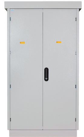
Street Cabinets PU-7