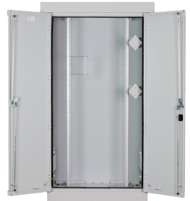
Street Cabinets PU-7