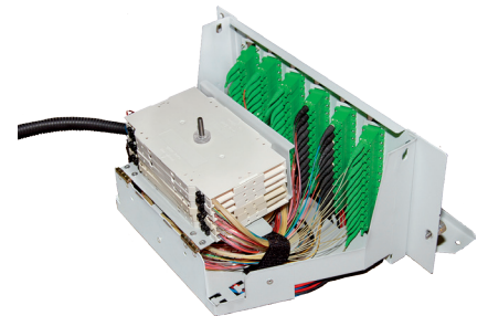
Module MPK-72 (for PSU-1)