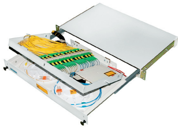
BPK-19 19" Distribution Panel