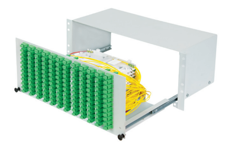
19" Patch Panel PS-19/144/4U