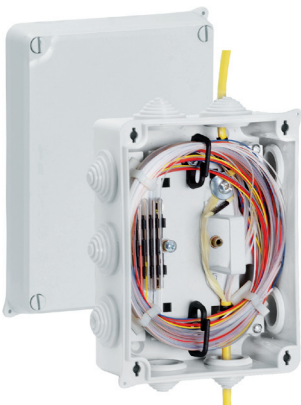
Wall Mounted Splice Box NMS-6