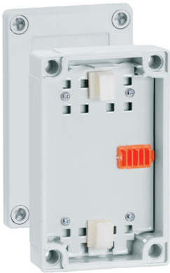
Wall Mounted Splice Box NMS-4