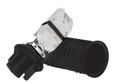
MUF - 6 Fibre Optic Splice Closure