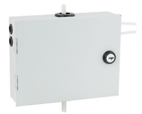
Shaft Splice Box MP-16D