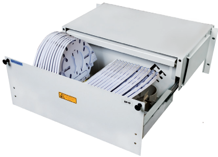
19" Splice Panel BP-19/288